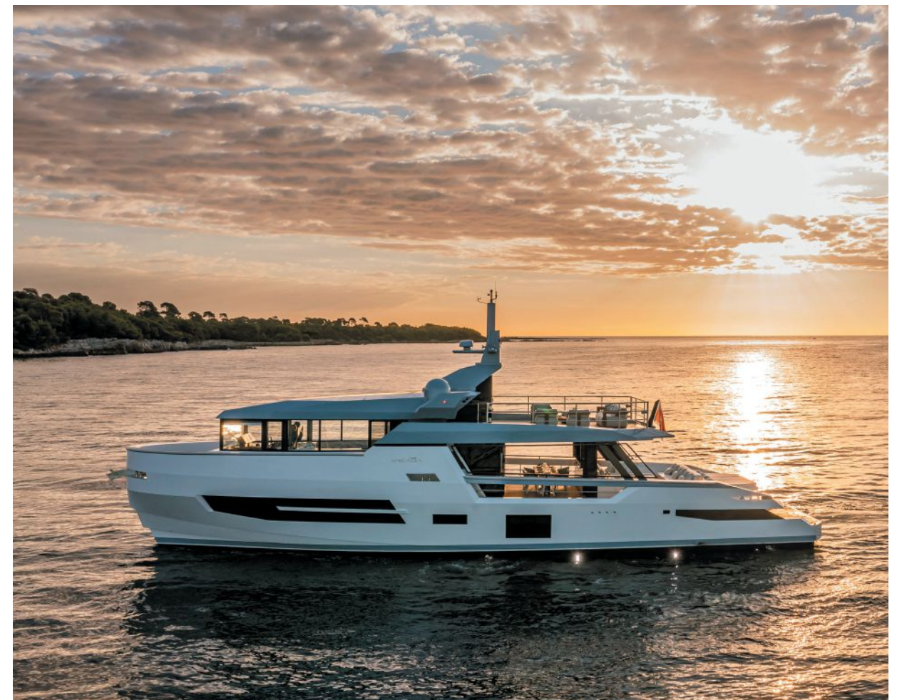
Above: Far-reaching views are available from all three decks. Left: In line with Arcadia's green approach, the semiplaning fiberglass boat has low energy consumption.