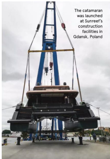
The catamaran was launched at Sunreef's construction facilities in Gdansk, Poland