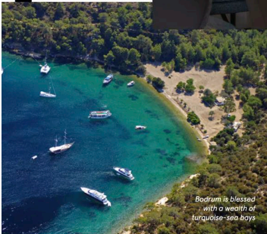
Bodrum is blessed with a wealth of turquoise-sea bays

Will the boat's explorer credentials and 5,000-nautical-mile range at 10 knots be put to the test outside the Med? "We don't have a plan to leave the Med yet, but why not," says Vural. "Our passion is to visit new places; that's why we built a boat like Kasif ." He also doesn't rule out sharing Kasif 's beauty with others by putting the yacht on the charter market one day - "We've talked with some companies about charter," he reveals - but for now, she will remain private.