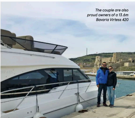
The couple are also proud owners of a 13.6m Bavaria Virtess 420

All of this detail was on display when Kasif appeared at the Monaco Yacht Show in 2023, attracting plenty of positive feedback from those who stepped on board. "The Monaco Yacht Show was a wonderful public debut for Kasif . We knew that she was a good and well-designed