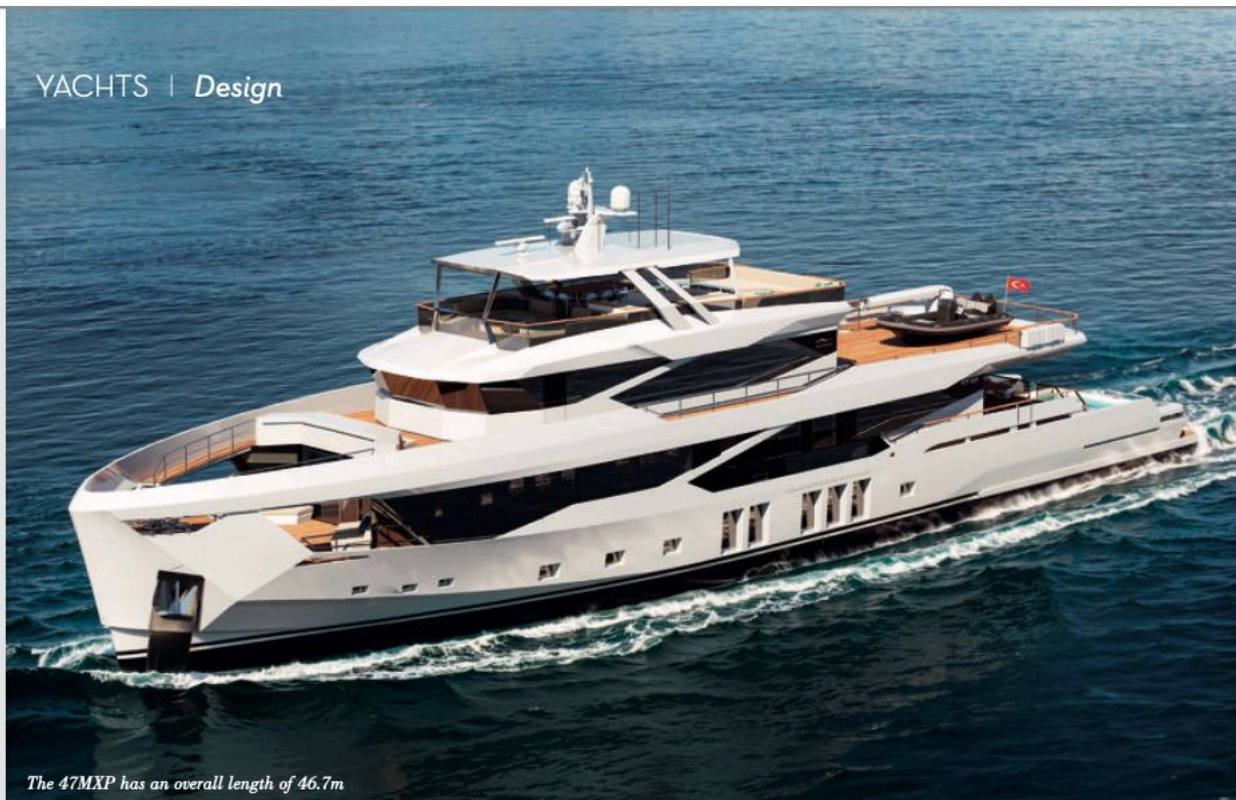
The 47MXP has an overall length of 46.7m