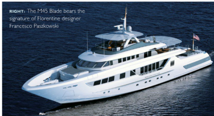
RIGHT: The M45 Blade bears the signature of Florentine designer Francesco Paszkowski

M50's overall image is of fast motion and seaworthiness. The yacht displays a well-proportioned volume with exterior and interior spaces offering comfortable living areas. Automotive-like features and details, typical of the Hot Lab style (all three designers have a background in the automotive industry), enhance M50's sporty touch.